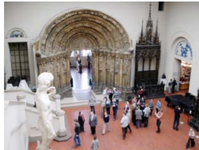
Pushkin fine arts museum