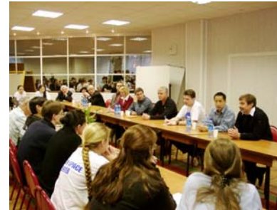
With Russian cosmonauts S. Krikalev, A. Lazutkin and American astronauts J. Phillips, E. Lu, 2002