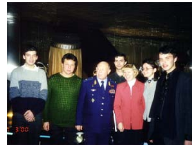
With Russian cosmonaut Alexei Leonov, 2000