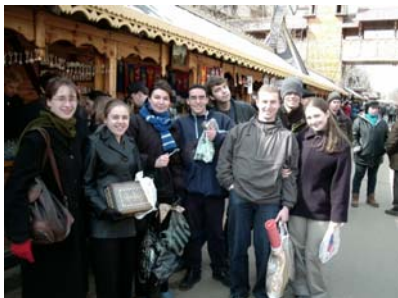
Izmailovo souvenir street market