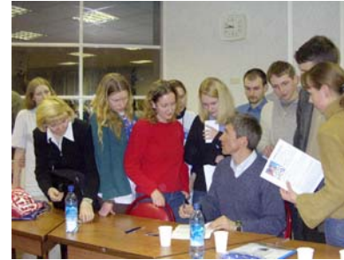
With Russian cosmonaut Sergey Krikalev, SDTP2003