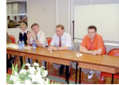
With Russian cosmonauts V. Kubasov and A. Serebrov, 2002