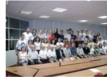
With Russian cosmonaut A. Lazutkin and American astronauts D. Tany and C. Hadfield, 2002