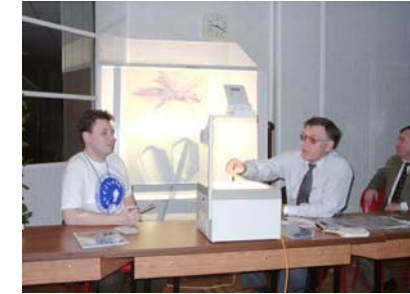
With Russian cosmonauts A. Serebrov and G. Strelakov, 2002